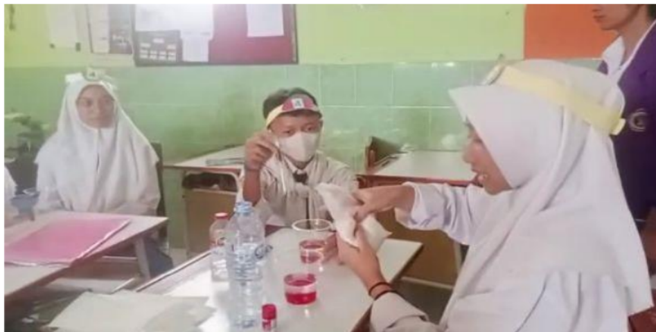
Figure 2. Students try to practice according to the instructions from the worksheet