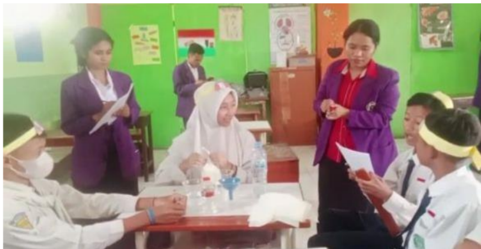
Figure 3. Students do practice and are accompanied by the teacher model, and two other student prospective teachers make observations of learning