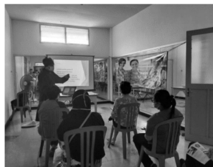
Figure 3. Counseling Activity at Panti Rahayu Clinic

absorption of information. The higher the level of education, it will be easier for someone to absorb information. People who have higher education tend to be more prone to hypertension than people who have low education. Education is significantly related to lifestyle, stress and nutritional status. Education is related to work and income received, the amount of one's income affects one's eating preferences (Nursalam, 2013). However, there are some hypertensive patients who have a high level of final education, namely the high school level, but their knowledge is not good. This can be influenced by several factors, including the attitude of the elderly, meaning that most hypertensive patients do not really care about a good diet for people with hypertension (Kristiawani, 2007). Family support, the family explains what is prohibited and allowed, to be consumed, explains the importance of complying with the diet given on the orders of a doctor or other medical personnel in order to avoid complications of hypertension, the heredity factor that is emphasized is not from a genetic perspective, but rather a hereditary diet in family. The tendency of hypertension in the family can be caused by the similarity of the diet of parents and children (Astria, 2009).