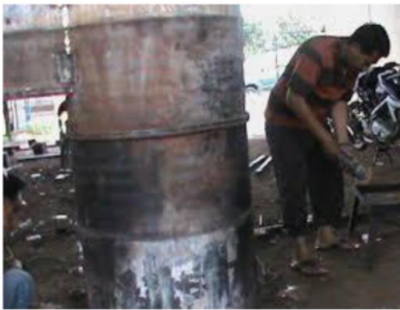
11 Figure 1a

stove and a container with principles such as frying (Figure 1 d) and using the stove from tin cans biscuit by the chimney and the hole (Figure 1 e). In this study, the latter method (Figure 1 e) are used. Application of the method has several advantages : the creation of installation (stove burners) is very simple and can be done by the farmers themselves, in good condition (not raining ) can burn the chaff with a capacity of up to 1 ton, the combustion process takes place slowly but the result is good (good quality of charcoal/ biochar , not easy to ash), the installation is easily to move so that the production process can be done anywhere, means farmers can do while doing other work (does not have to wait until finished).