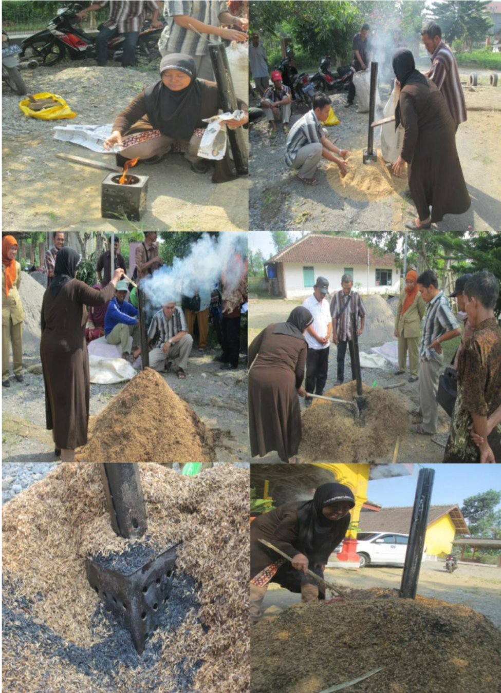
Figure 1e : Simple installation of biochar production