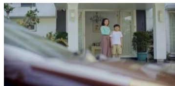
Figure 4. A mother is at home with her child while her husband works outside.

The picture above can be analyzed that men have an ordinate role (primary) in society because they are considered more substantial, more potential, and felt more productive. Meanwhile, women are considered to have a subordinate role (controlled) because they are considered less productive. The consequence of this assumption is that men have the head role of the family and breadwinner by working in the public sphere (working outside the home) while women take positions in the domestic sphere.