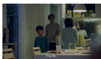
Figure 2. The activity of a mother who cooks and prepares the dining table for family sahur

At the denotation level, a mother can be seen approaching her child in the toilet and reminding her child to wash their hands because it near dawn time. It can be analyzed that women's presence is very close to children so that they always pay attention to their children. At the level, it signifier can be analyzed that the women's function in family scope is determined by the perspective of how women can organize and manage the domestic sector and provide protection to their children. When a woman tends to look after and protect her child, it is a success and a measure of success as a mother (Novrinda & Yulidesni, 2017).