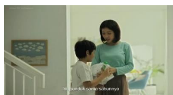
Picture 8. A mother brings a towel and soap to her child after he plays.

The denotation sign above shows a mother having a dialogue with her child, and in the next picture, that mother takes Dettol branded bath soap with a towel and gives it to her child. From the scene, it can be interpreted that denotation meaning is as follows: the mother's role in a household also always gives its impression. Not only educating her child to perform prayers so that the cleanliness of her faith is maintained and still behaves well, but a mother also supports the physical cleanliness of her child by giving bath soap and towels and immediately telling the child to take a shower. It can be analyzed that women's real condition in society has a different position from men, namely that women are fully responsible for taking care of children and taking care of physical and children's spiritual cleanliness and families. Meanwhile, for men, not only do they feel they are not responsible, even in many traditions, men are traditionally prohibited from engaging in domestic work.