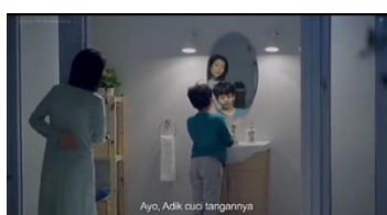
Figure 1. A mother's activity in the bathroom with her child.

The message on women's role in Dettol Soap advertisement describes it in educating and fostering a household. The presence of women in Dettol Soap advertisement is also inseparable from domestic work. For example, in one of the ad scenes, a mother reminds her child to wash her hands because it will be imminent. According to (Fakih, 2016), a stereotype is the labeling or marking of a particular group. In there, stereotype women are always depicted as having a role in taking care of children. An example is in one of the scenes below: