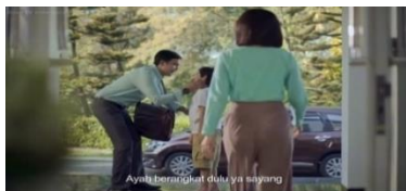
Figure 3. A mother, in front of the house with her child, while her husband is leaving for work

household has multiple jobs or has numerous parts: childcare and cooking. The double load is also depicted in the scenes below: