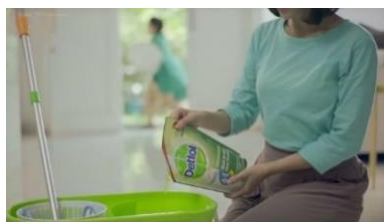
Figure 5. A mother is mopping the floor at home after her husband leaves to work outside.