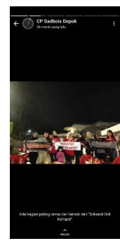
Figure 5 The Srikandi of Didi Kempot who also enlivened all of Sobat Ambyar's activities.

In addition to post photos and videos, Sobat Ambyar also strives to continue to spread interest through various interesting, funny, and viral content on social media. Like karaoke, song covers, to Ambyar quotes. With this trend, Sobat Ambyar is active on social media and involved in off-air activities. One of them is