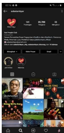
Figure 1 @sobatambyar account uploading things related to Didi Kempot

In a series of interviews with admin Sobat Ambyar from Depok, we found that being a fan of "Pakde Didi" is about liking his nice songs or following their conditions and assuming that Didi Kempot as a representation of Javanese culture must be preserved. This identity is one of the keys to the ongoing fanbase world that makes them unite, making them feel part of a particular identity, namely Sobat Ambar (Hogg, 2018).