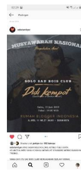
Figure 4 National conference for sadboys and sadgirls inauguration.