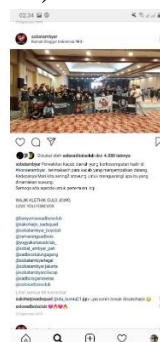
Figure 3 Gathering between Sobat Ambyar throughout Indonesia.