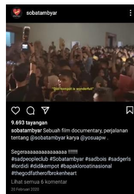
Figure 13 Initial information on the filming of Sobat Ambyar.