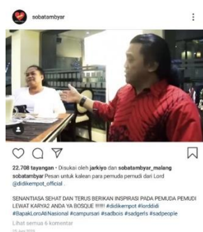
Figure 2 @sobatambyar account Uploading Didi Kempot's daily activities