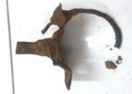
Fig. 13. A leak due to a corroded tapping point on 90 mm PVC pipe