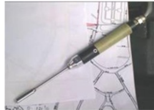
Fig. 4. Sniffing Probe

Subsequently, the pipelines on-site are traced by using a pipe locator and the detection could be done accurately. The pipe locator is used, so that the drilling bit does not hit other utilities located adjacent to the pipe lines during the drilling process. Afterward, the pavements along the pipe lines are drilled using several types of drilling machines, as listed in Table 1. Selection of the drill bit length depends on the pavement thickness on-site.