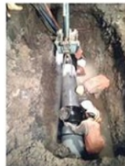
Fig. 11. A process of leak repair on the 500 mmPVC pipe joint