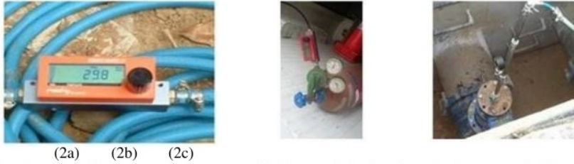
Fig. 2. Helium flow meter (2a); Process of helium gas injection into the pipe network (2b and 2c);

The samples of helium gas can be taken from existing tapping points, air valves or water taps from house connections, which the helium gas can release to the air. The samples of helium gas are placed into bottles and detected using a sniffing probe (Fig. 4). If the sniffing probe detects any presence of helium gas from the sample, then it indicates that the helium gas has spread throughout the networks and the detections are ready to be carried-out.