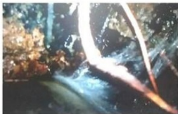
Fig. 10. A leak due to a broken 500 mm PVC pipe joint