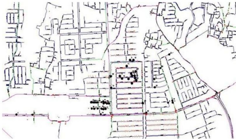
Fig. 9. Locations of leak findings in PuriKembangan (Zone B9), West Jakarta (●= leak findings)