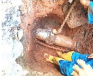
Fig. 14. A leak due to a broken clamp saddle, on a pipe (110 mm PVC)