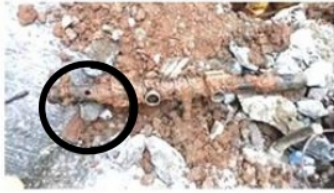
Fig. 12. Perforated 63 mm PVC pipe (marked by a circle)