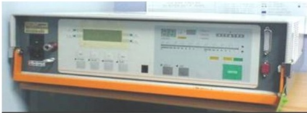
Fig. 3. Helium Leak Detector

The samples of helium gas can be taken from existing tapping points, air valves or water taps from house connections, which the helium gas can release to the air. The samples of helium gas are placed into bottles and detected using a sniffing probe (Fig. 4). If the sniffing probe detects any presence of helium gas from the sample, then it indicates that the helium gas has spread throughout the networks and the detections are ready to be carried-out.