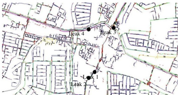
Fig. 6. Locations of leak detection findings at PasarPesing (Zone B6), West Jakarta

Leak 2 was detected in 160 mm PVC pipe line, which was caused by a broken accessory (clamp saddle). Similarly, Leak 3 was detected in 200 mm DCI pipeline, which took place on a broken accessory (clamp saddle). All those leakages did not appear to the surfaces due to a thick asphalt pavement. Estimated leak flows and leak causes are displayed in Table 2. Although, the detected area is very congested due to vehicles and a public market, its high noise backgrounds did not affect the helium detector accuracy in locating the leakages.