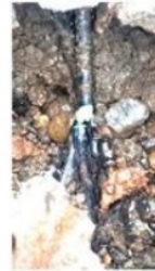
Fig. 15. A leak due to non-standard installation distribution of a house connection pipe (25 mm HDPE)