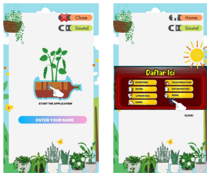
Figure 1. Display of Biobotanical Flash Application

In interactive activities, students can interact actively and improve their experience with a botanical application, this is because of the combination of audio, video, graphics, images, and animation elements. This process can be attractive and can generate feelings of pleasure, attention, interest, and student involvement (Tan et al., 2010). And in reflective activities, students reflect on all their learning experiences so that they adjust their conceptions, which will then be transformed into assignments into tests.