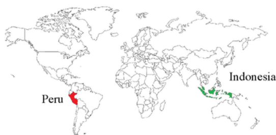
Figure 1. Location of Indonesia and Peru in the world

more than 30 million inhabitants in 2011 (39 th rank in the world) who are mainly located on the coast.