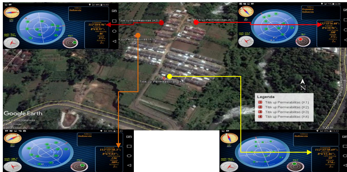
Figure 5 The Point Test Plot Map for Permeability (K) (Google EarthPro2018 & Ulysse Gizmos)

A residential settlement area, the area of the catchment is as big as 0.19 km 2 . the extent of the catchment area is divided into 3 zones of land flow in accordance with contours.