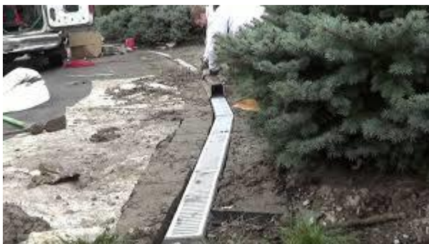
Figure 3 Drainage Channel