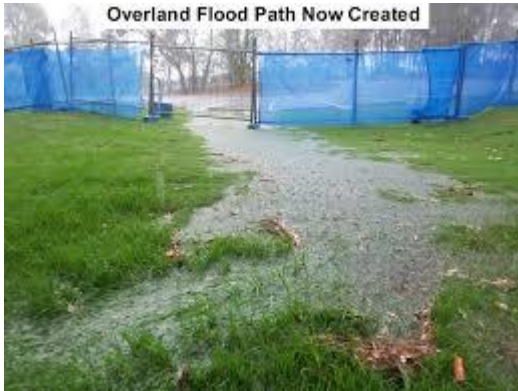
Figure 1. Overland Flood Path