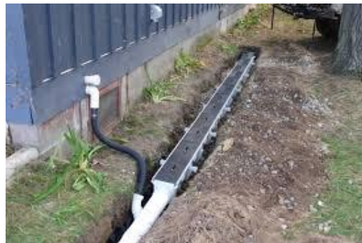
Figure 4 Drainage Channel in Household

The drainage channel design is composed of the channel discharge plan components and flow velocity, as shown as in figure 3 . Length of channel, slope, and roughness of channel are influence the time of concentration, time to peak. Time of concentration will be higher as length of drainage channel longer. The flow velocity with the concept of water balance is interpreted in rain intensity with mm / hr unit and the drain coefficient as the factor of the abundance of water overflow with the land use parameter. For a uniform rain, the duration equals the equilibrium time, whose flow rate is equal to the rate of additional rain (Fang, 2007).