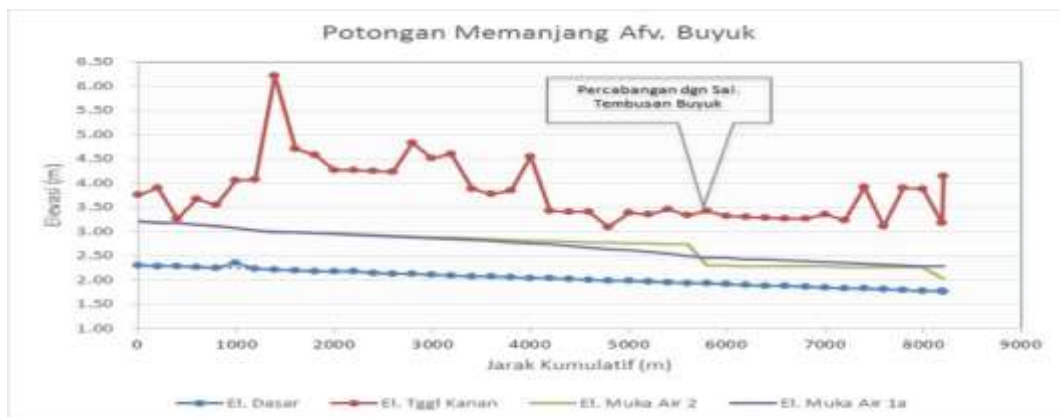
Figure 2. The influence of the tides in the Afv. Buyuk on P38 or 3.8 km from BB Permisan)

discharge is Discharge of fresh water coming into the system that originates from the upper Afv. Buyuk and Afv. Kedondong. Changes occur at a point approximately 2 km, the change is due to a meeting with channel effluent Buyuk. With the dimensions of the ducts that is wide, and transverse cuts of existing channels, then generate high air about 2.8 metres until the end of line length effluent Buyuk.